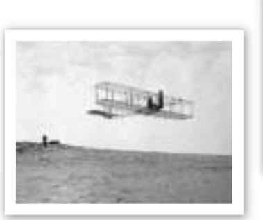
1903: Bicycle makers Orville and Wilbur Wright build a powered airplane. Orville flies 120 feet in 12 seconds.