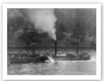
1807: Robert Fulton builds the Clermont. It is the first steamboat that carries passengers and stays in business.

Today, computer technology often controls transportation systems. Computers keep systems running on time. They also keep the systems running properly. Space transportation uses computers and computer models. Scientists are able to solve problems such as weightlessness and airlessness from far away.