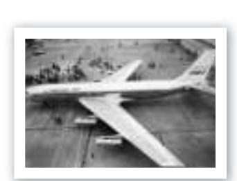
1959: Transcontinental jet service connects New York City and Los Angeles.

2004: In Shanghai, China, the world's first commercial maglev rail system begins operating.