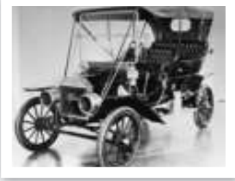
1914: Henry Ford's factory mass produces automobiles. More people can afford to own a car.