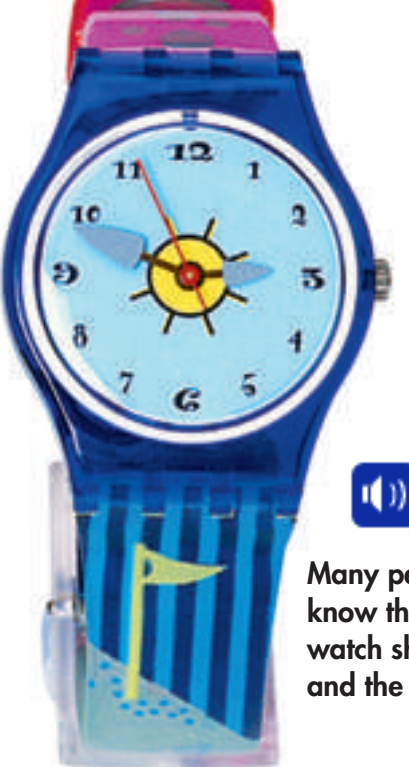
Many people wear watches so they know the time. The hands on a watch show the hours, the minutes, and the seconds.

Technology has brought us many new products. This could be the car of the future!